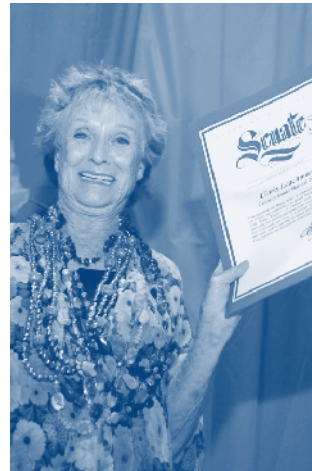
During Pride Brunch, Cloris Leachman shows off her State of California certificate of recognition as Celebrity Grand Marshal for Pride 2009.