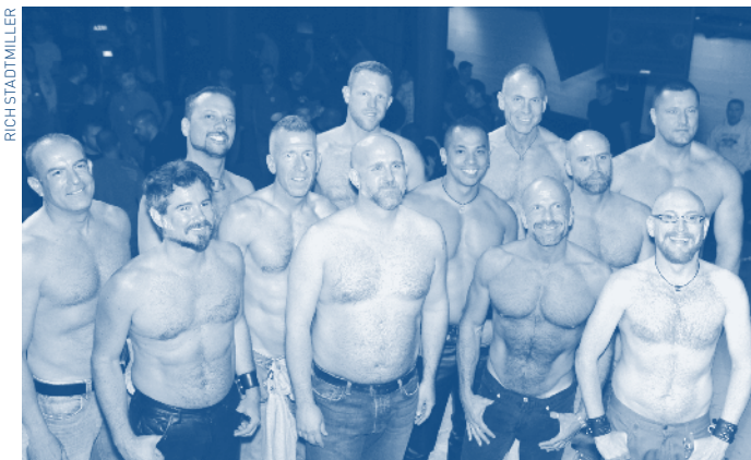
After months of grueling competition hosted by the Powerhouse, the 2010 Bare Chest Calendar Men were selected at the Finals held at DNA Lounge.

A number of the early efforts to support PRC have since become San Francisco institutions. The Bare Chest Calendar , beginning as a small project of the South of Market leather bars in 1985, now raises thousands of dollars for PRC and AIDS Emergency Fund and makes local celebrities of the Calendar Men.