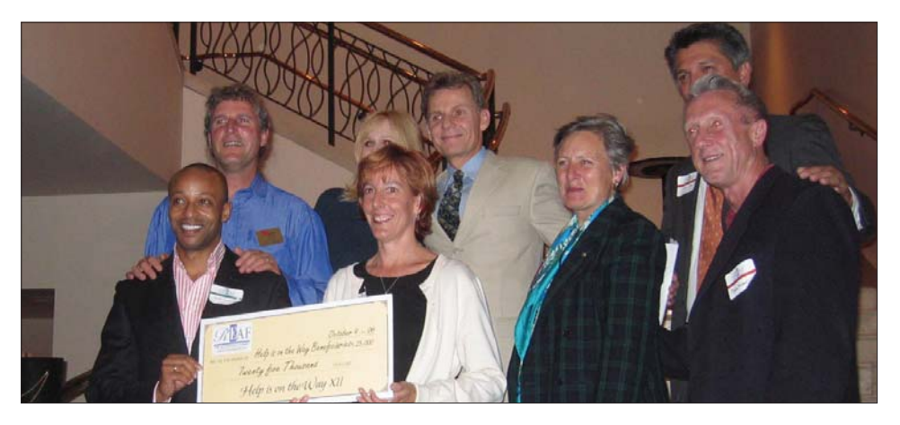
Help came in the form of a check in the amount of $155,000 for 10 beneficiary agencies, including PRC, when The Richmond/Ermet AIDS Foundation distributed the proceeds from their 12th annual Help is on the Way Gala.