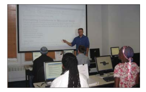
Technology Facelift—PRC clients have the opportunity to learn in a state-of-the-art computer lab thanks to grants totaling over $30,000 from The Bothin Foundation and Macy's Passport Fund.