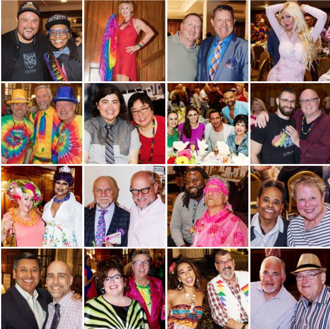
All Pride Brunch Photos